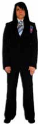
Standing before the fight