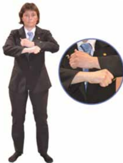
Penalty for fingers inside sleeve