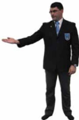
To call the doctor