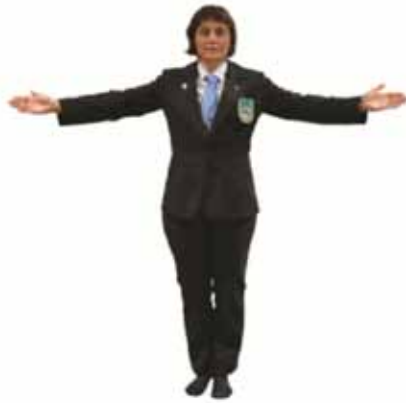
Inviting Contestants on the tatami