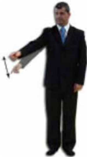
Shido for stepping outside